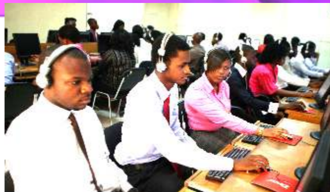
Media Section of the University Library