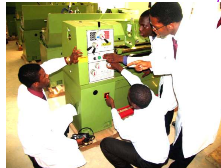
Some Engineering Students in practical class