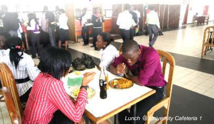
Lunch @ University Cafeteria 1

The University operates Cafeteria services from two locations on campus. Food is made available to students