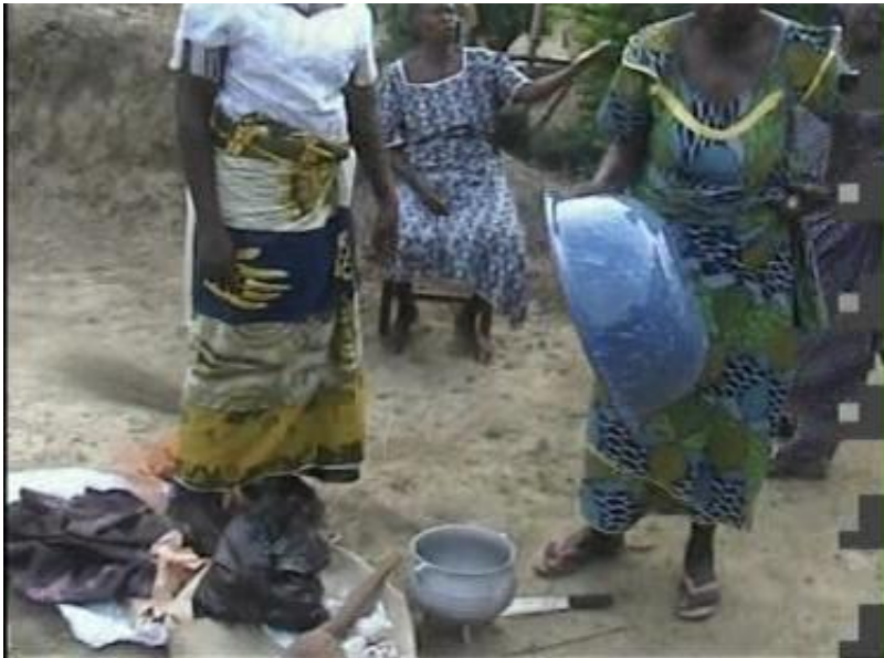
Fig. 3. The umuada preparing props for a burial dance.

the woman has duties that include the preparation of meals during festivals and title taking events in her consanguine community. It is also their duty to prepare ritual items and props used in the performance of female burial dances (Fig 3). There are other duties which the ndiomu are expected to perform but which cannot be exhausted in this seminar. What is important to remark here is that the umuada of Osomala, continues to attend the dance sessions expected of every umuada . She will also be expected to assume her position as ada-uku (the eldest woman or chief ada ) when such a time comes, provided she had reached menopause, she will be expected to return to her community and take up her position. In the event that she cannot, she will be expected to marry a substitute wife for her husband to fill her role in her absence. This is the first implication arising from her dual identity.